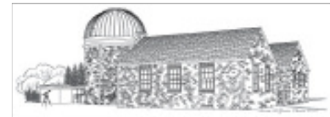
CUSTER INSTITUTE AND OBSERVATORY